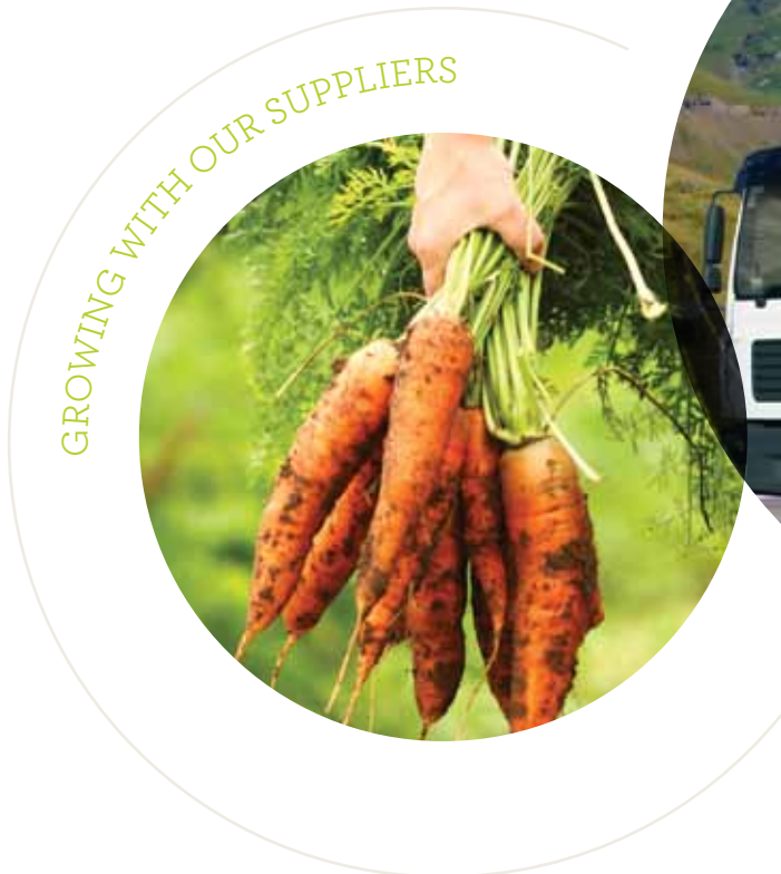
GROWING WITH OUR SUPPLIERS